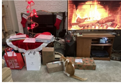
We didn't have as many lights outside but the display was still nice to come home to after the Christmas eve service. We had a minimalist tree too but lots of interesting packages on Xmas day.