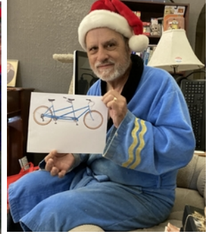
We recorded our unwrapping. T-shirts from Mad & Billy, our possible gift to each other, a tandem bike.