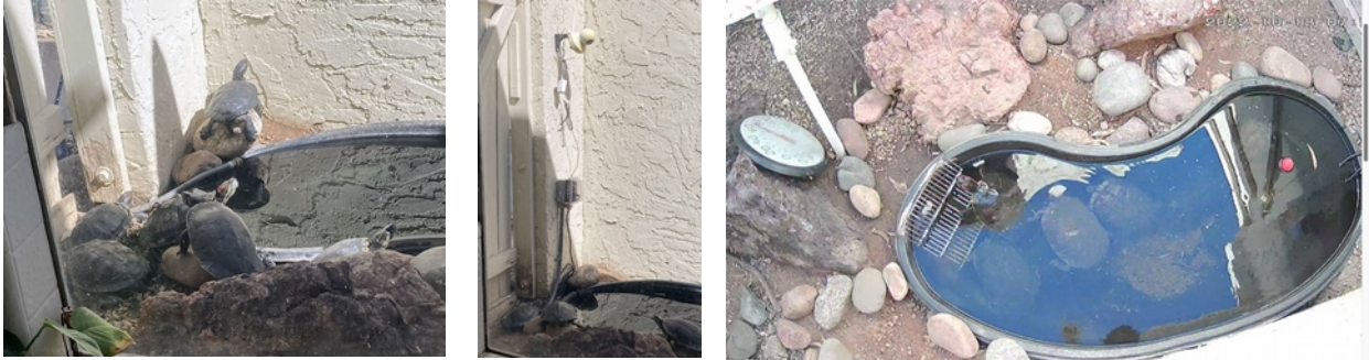
My six Red-eared Slider turtles got upgrades in their area, a new, safe electric outlet for their filter and the camera that Smoot installed that allows me to check on them at any time.