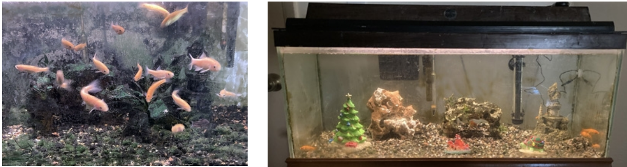
My fish tank got a change too. I switched from Ruby Red Minnows to Goldfish, with a hiding Plecostomus. The tank also got a new heater and thermometer and holiday decor. I had the minnows as feeder fish for my turtles but they're too lazy to chase them alive so only ate them after they died!